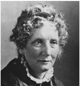
Harriet Beecher Stowe