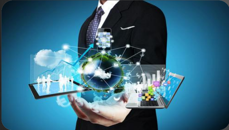
English for Information Technology