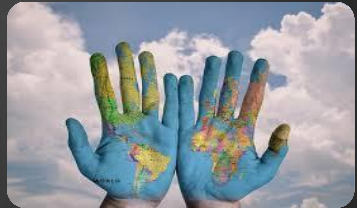
➤ English for Culture and Creativity