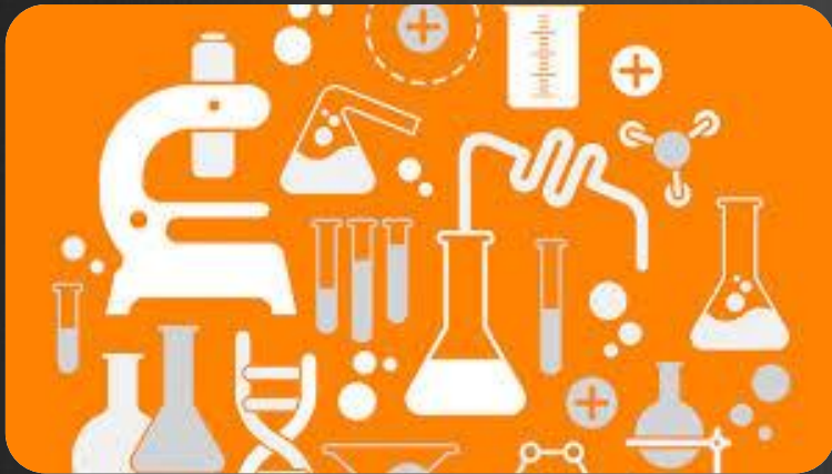
English for Science and Engineering