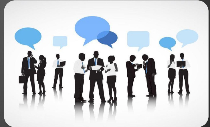
➤ English for Business