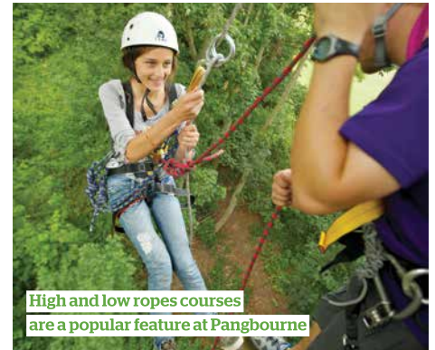
High and low ropes courses are a popular feature at Pangbourne