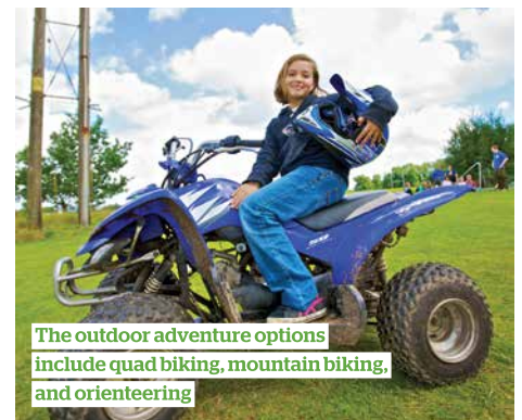
The outdoor adventure options include quad biking, mountain biking, and orienteering