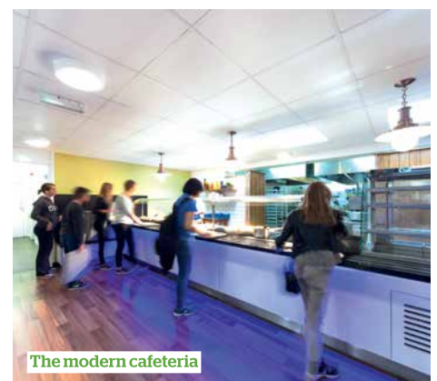
The modern cafeteria