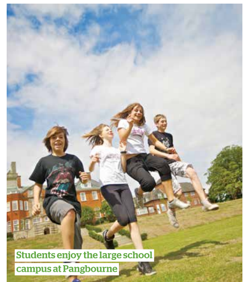
Students enjoy the large school campus at Pangbourne