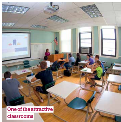
One of the attractive classrooms