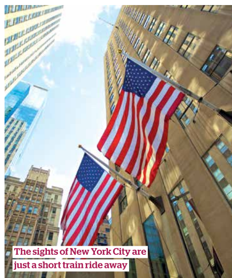
The sights of New York City are just a short train ride away